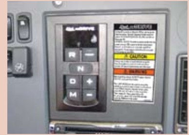
Dash Mounted Shifter